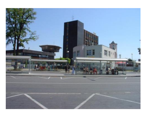
as Prague, Vienna, Münich, etc.

M. R. Štefánik International Airport is located 15 km from Bratislava Old Town. At the airport you can take bus No. 61 to Hlavná železničná stanica (Main Railway Station).