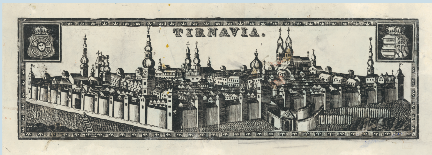
Slovak Engraver: View of Trnava, 1801–1850. Ernest Zmetak Art Gallery (SVK:GNZ.G_1387)

9:30 – 11:00 Guided tour of the historical centre with archeologist Erik Hrnčiarik